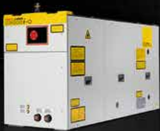
FANUC Laser Systems