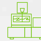
ROBOCUT Wire cut EDM